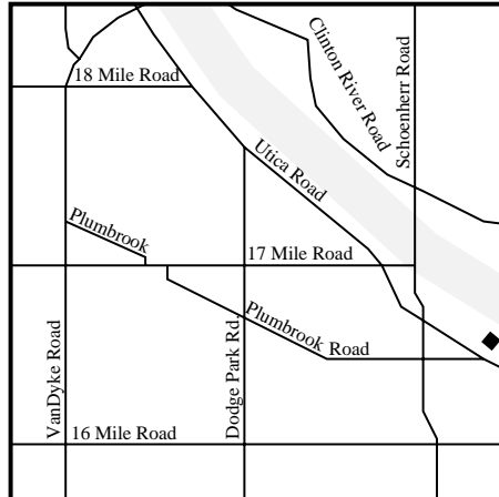
SHCC at Carpathia Club

Newsletter submissions are due 8 days before the club meeting, but the earlier the better. They should be sent to: