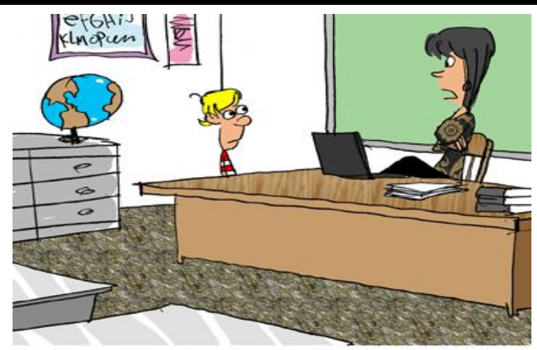
"You hacked into the school's computer system to give yourself an 'A,' so you're getting an 'F.' But, I will give you extra credit for your tech skills."

This cartoon was reprinted with permission from the "How To Geek" online newsletter, available online at newsletter@howtogeek.com