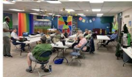
Those physically present at the 4 September "hybrid" membership meeting